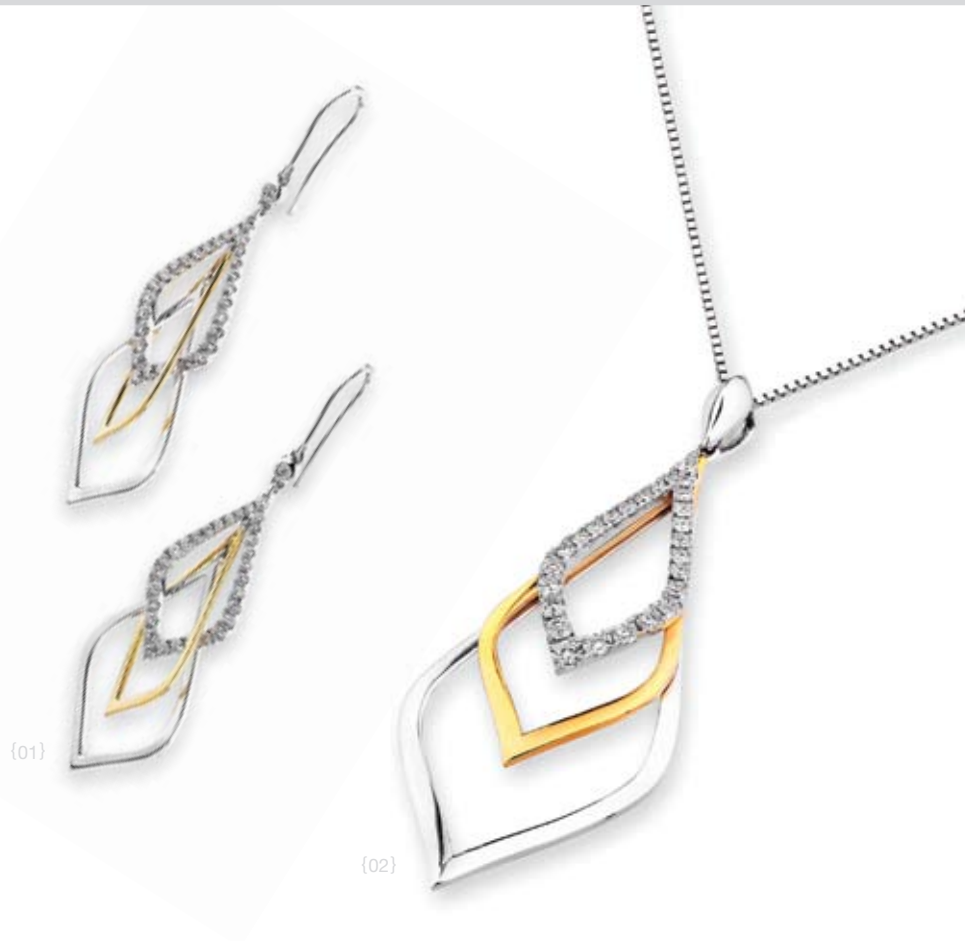
01 18WY MULTI DROP DIAMOND EARRINGS (9VIA12) $3,725 02 18WY MULTI DROP DIAMOND PENDANT (9NIA13) $2,150