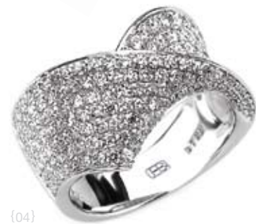
02 18W DIAMOND GYPSY EARRINGS (9VIA09) 03 18W DIAMOND PENDANT (9NIA10) 04 18W PAVE DIAMOND RING (9YIA09) 05 18W DIAMOND PAVE DROP EARRINGS (9VIA05)