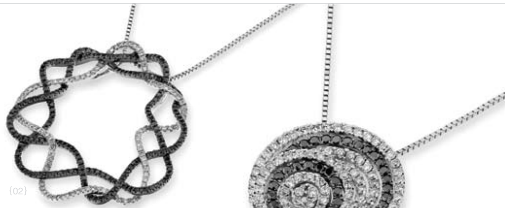
01 18W BLACK AND WHITE DIA FANCY PENDANT (9NIA02) $3,950