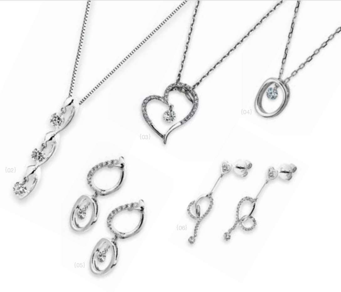
01 18W DIAMOND DROP EARRINGS (9VIA15) $4,550