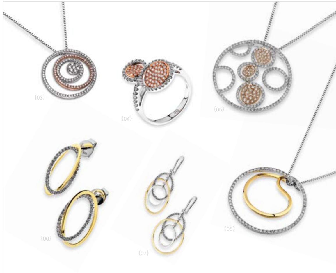
03 18RW PAVE DIAMOND CIRCLE PENDANT (9NIA06) 04 18RW CIRCLE PAVE RING (9YIA16) 05 18RW MULTI CIRCLE PAVE DIAMOND PENDANT (9NIA14) 06 18WY INTERTWINED DIA EARRINGS (9VIA03) 07 18WY INTERTWINED DIA DIAMOND DROP EARRINGS (9VIA02) 08 18WY CIRCLE DIAMOND PENDANT (9NIA07)

$4,150 $3,675 $6,435 $1,850 $1,730 $3,550